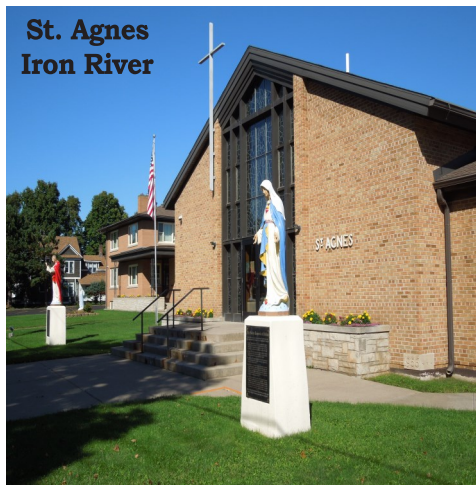
St. Agnes Iron River