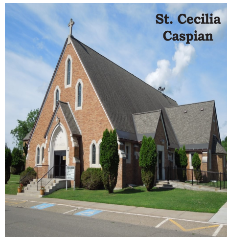
St. Cecilia Caspian