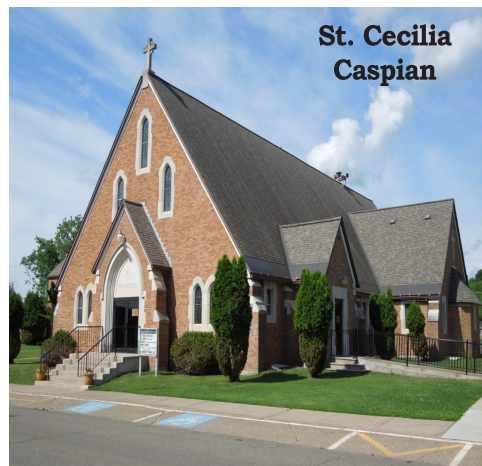
St. Cecilia Caspian