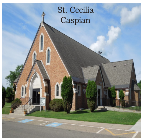
St. Cecilia Caspian