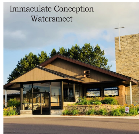
Immaculate Conception Watersmeet