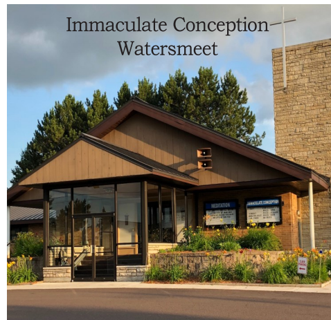
Immaculate Conception Watersmeet